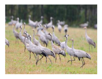
According to data from the Environmental Board, the peak number of Common Cranes occurred here, in 2006, when 23,000 birds were counted in Matsalu area, and 55,000 as the total in Estonia.