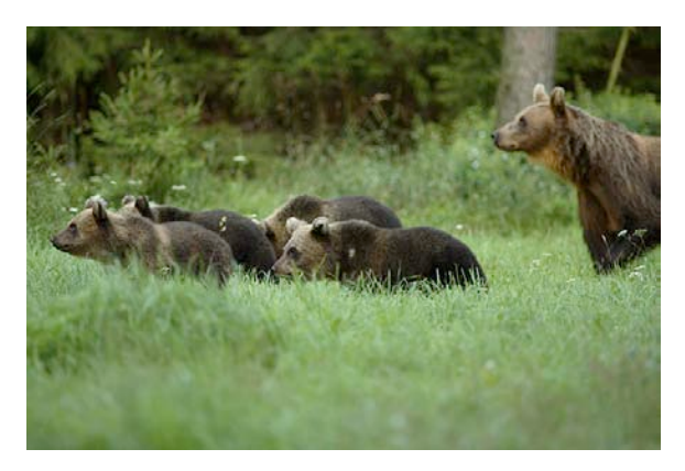
Estonian forests are renowned in Europe for their healthy populations of mammals, with around 700 to 800 lynx, more than 150 wolves, 500 to 600 brown bears and almost 20,000 beavers – tremendous numbers for such a small country.

Estonia is a small and wonderful place to see wildlife, at any time of year, with fantastic bird watching, including Steller's Eiders, Ural Owl, Pygmy Owl, Great Snipe, Nutcracker, Citrine Wagtail, Lesser Spotted Eagle, eight species of woodpeckers, sea ducks, Hazel Grouse and massive numbers of birds on migration. Estonia is locked between the Finnish Gulf, the eastern coast of the Baltic Sea and Lake Peipsi near the