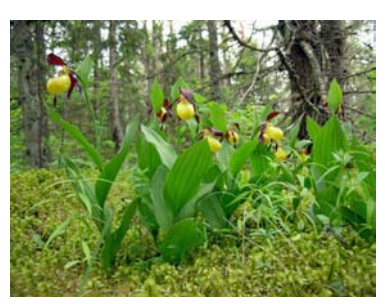
Thirty-six species of orchids (including the Lady's Slipper shown here) have been found in Estonia. © Anneli Palo.